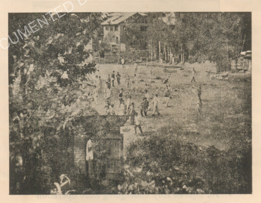
Police hirelings collecting Stones for pelting Shitalnath crowd on 25th august.