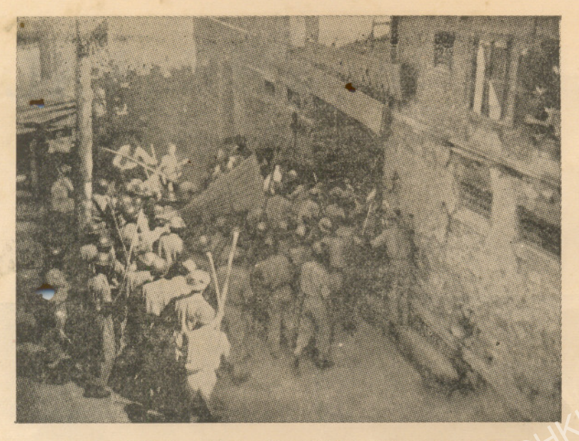
Exposition of Police Barbarity at the only exit at Shitalnath. "JALLIANWALA BAGH" TRAGEDY REPEATED.